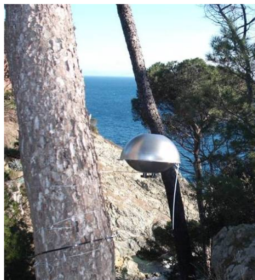
Figure S1. Schematic representation of the PUF disk sampler and photo of PAS deployed.